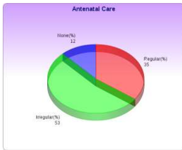
Fig 3: Distribution of the study population by antenatal care

Figure 3 shows that 35 (35%) were on regular antenatal care, 53 (53%) had irregular and 12 (12%) had no ANC. Table IV shows that out of 100 women, 35 (35%) were primigravida, 31(31%) were 2 nd gravid and the rest 34 (34%) were 3 rd or more.